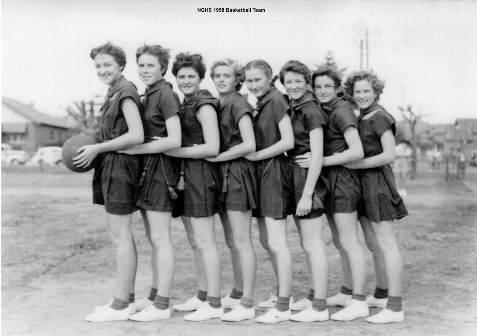
NGHS 1958 Basketball Team